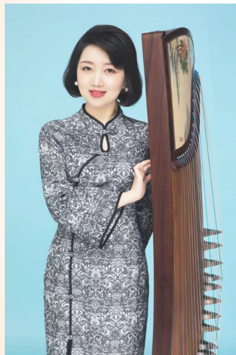
LIU Xin 劉欣